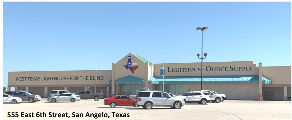
555 East 6th Street, San Angelo, Texas

Well we did it!!! We have made the move to our new building. We knew it wouldn't be easy and we worked hard, so it would not interrupt our day to day business.